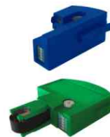
testifire® smoke capsule TS3