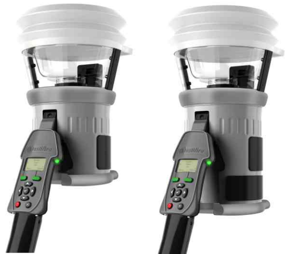
Testifire 1000 Smoke & Heat Testing