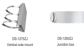
DS-1275ZJ Vertical pole mount