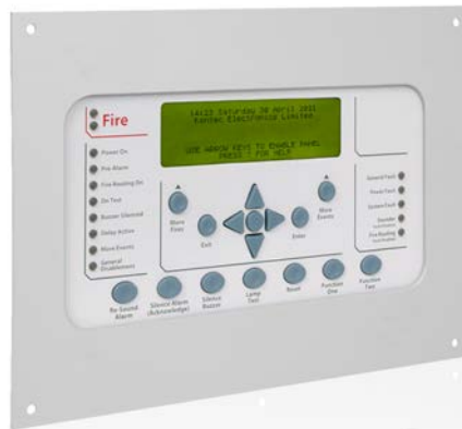
Model No. MK67000AM1